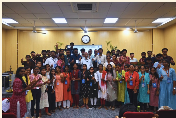
DoE National Seminar