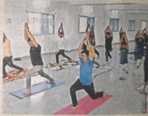
కేంద్రీయ విశ్వవిద్యాలయం విద్యార్థులు