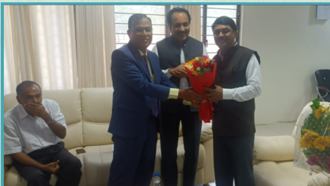
Visited JNTU on the occasion of Convocation Day and met Dr G.Satheesh Reddy, Chairman DRDO and Shri S.Somanath, Chairman ISRO.