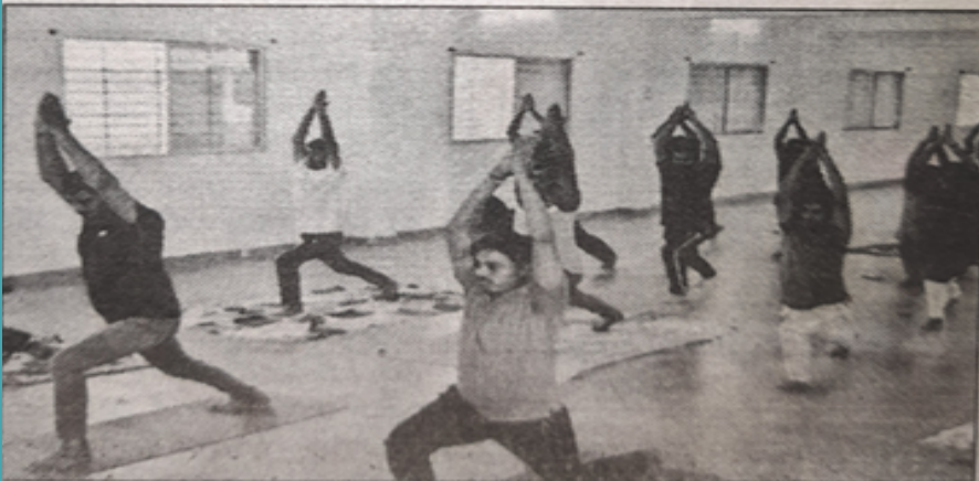
యోగాసనాలు వేస్తున్న సెంట్రల్ యూనివర్సిటీ విద్యార్థులు