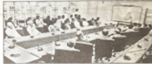
ప్రధాని నరేంద్ర మోదీ కేంద్రీయ విశ్వవిద్యాలయంలో పరీక్షపే చర్చ